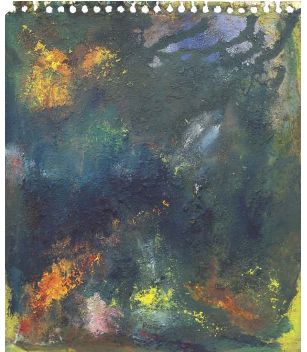
Dark and Deep . 2016