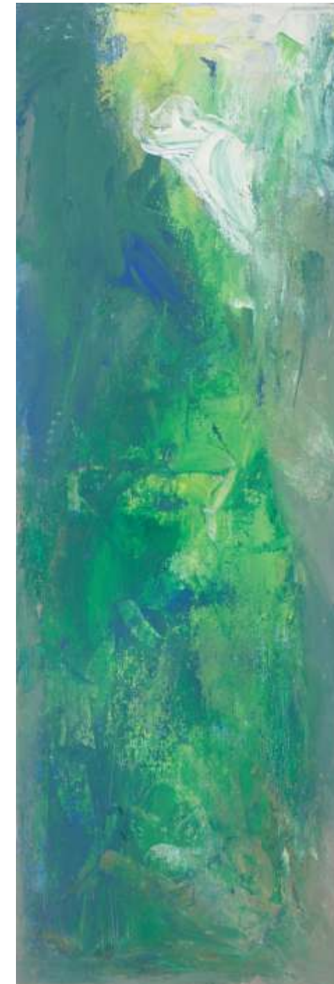
Monsoon a Pleasant Season . Mixed media on canvas . 61 x 20 cm

The activities of the Centre encompass the entire cultural domain, including music and dance programmes, painting competitions, screening of Indian and Bangladeshi films and documentaries, film festivals, art exhibitions, book launches, lecture-demonstrations, group discussions workshops in Yoga, Hindustani Classical Vocal and Instrumental music, Indian Classical Dance and Painting, etc. The Centre has promoted active cultural exchange of top Indian and Bangladeshi cultural artistes through regular bilateral visits for performances in each others' nations.