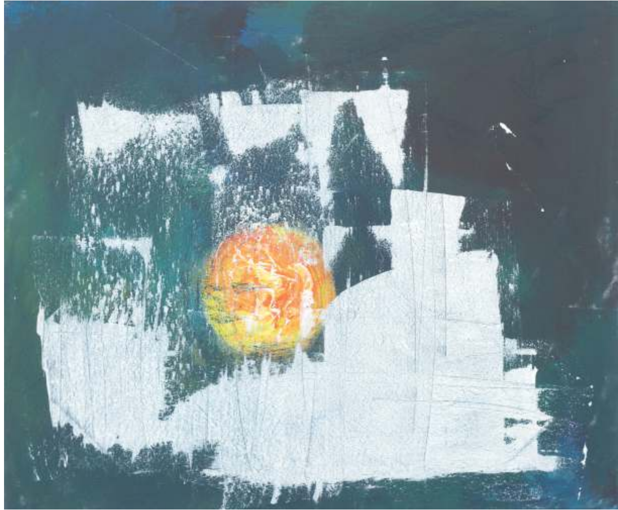
Circling Mystery . Mixed media on canvas . 50 x 60 cm