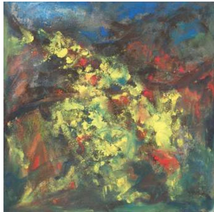
An Exotic Glow Mixed media on canvas . 60 x 60 cm